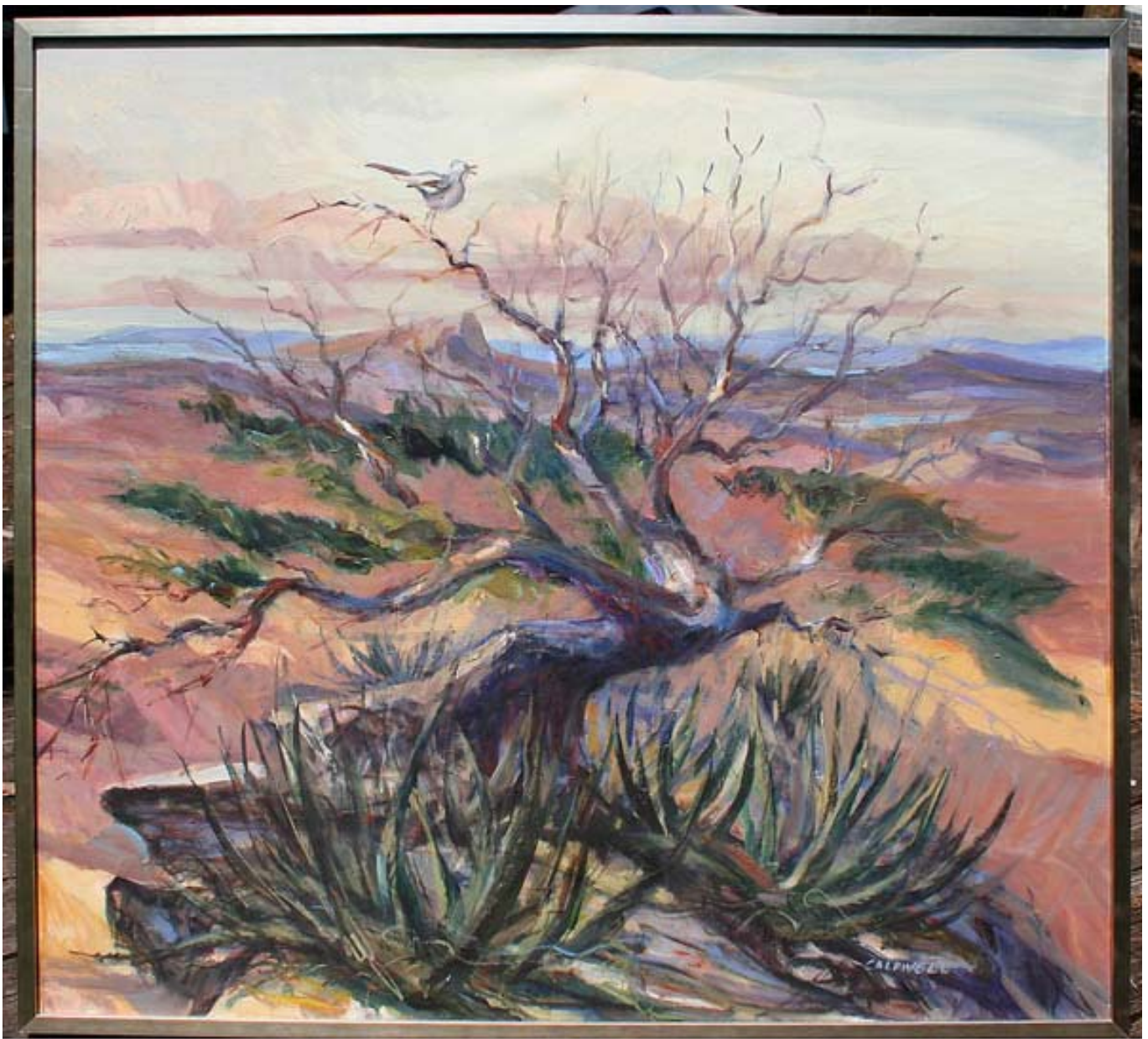
"South Texas Canyon Owner."

Below, "West Texas Blue Quail Hunting Techniques." A triptych in progress.