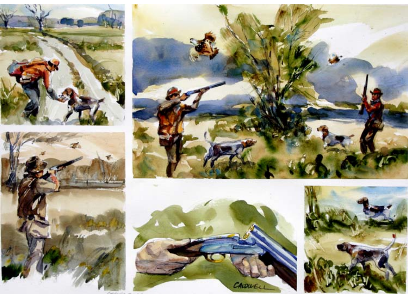
Five studies for "South Texas Quail Hunters"

"Hardscrabble Ranch Between Sanderson and Marathon, 1972" (Later becomes the Big Bucks Spread, 2002)