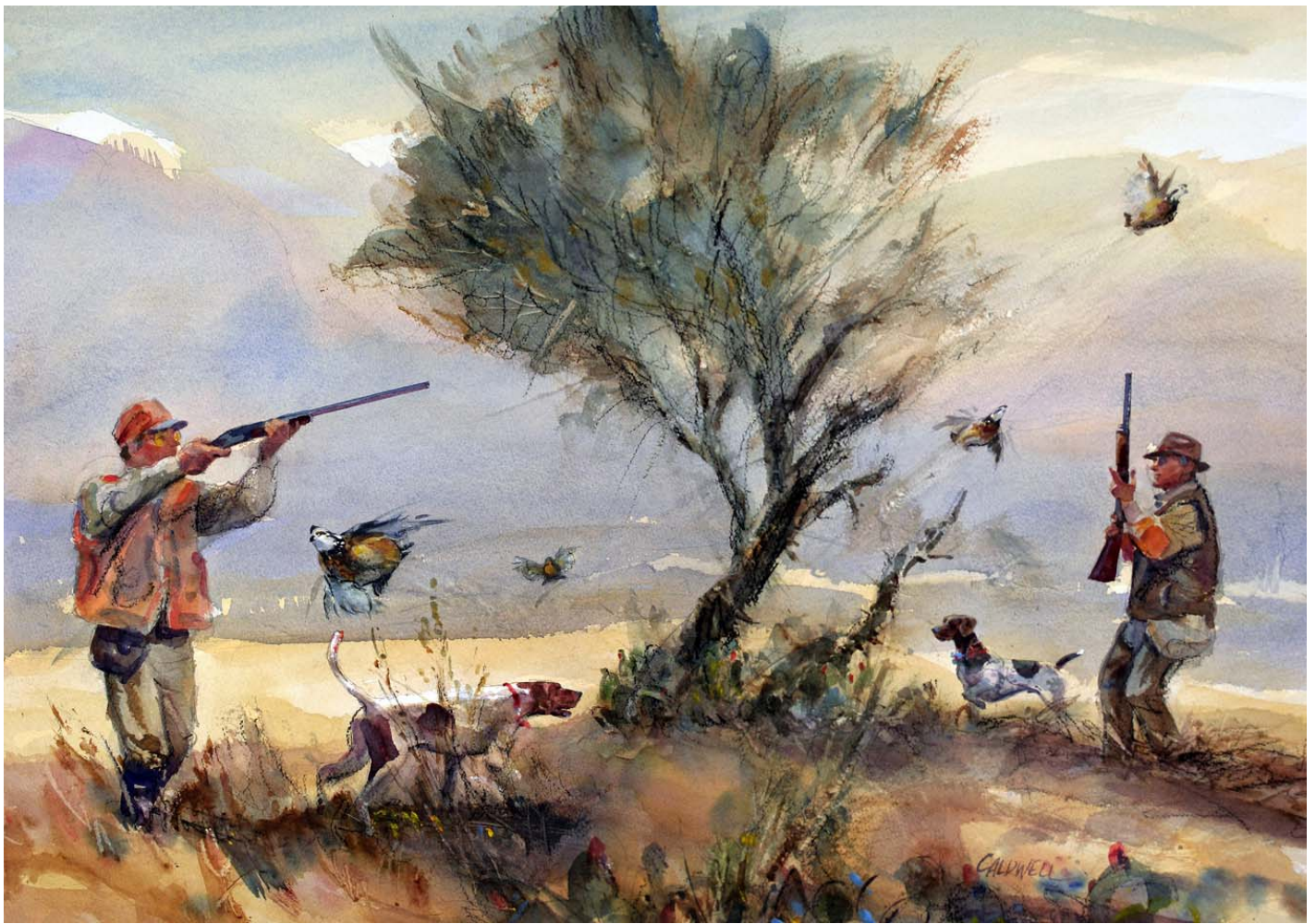
"Quail Tree" "Whitewings Over Big Bucks Ranch"