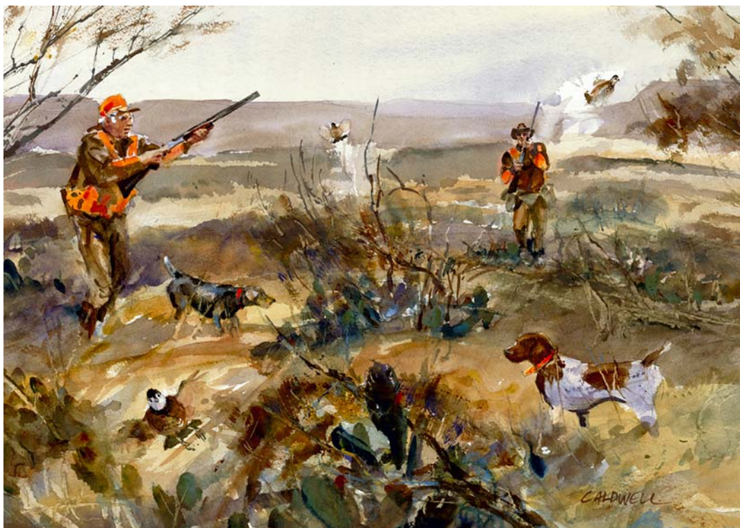
"Quail Explosion" "Let's Go Rodeo"

A few South Texas images from ancient and recent years. Most are in collections, but the images are mine. Large Gclees are available from all paintings, or brand new paintings can be commissioned, based on these images. For availability, and the possibility of commissioning Caldwell paintings, go to www.samcaldwell.com , or visit with Sam Caldwell at 281-455-9390.