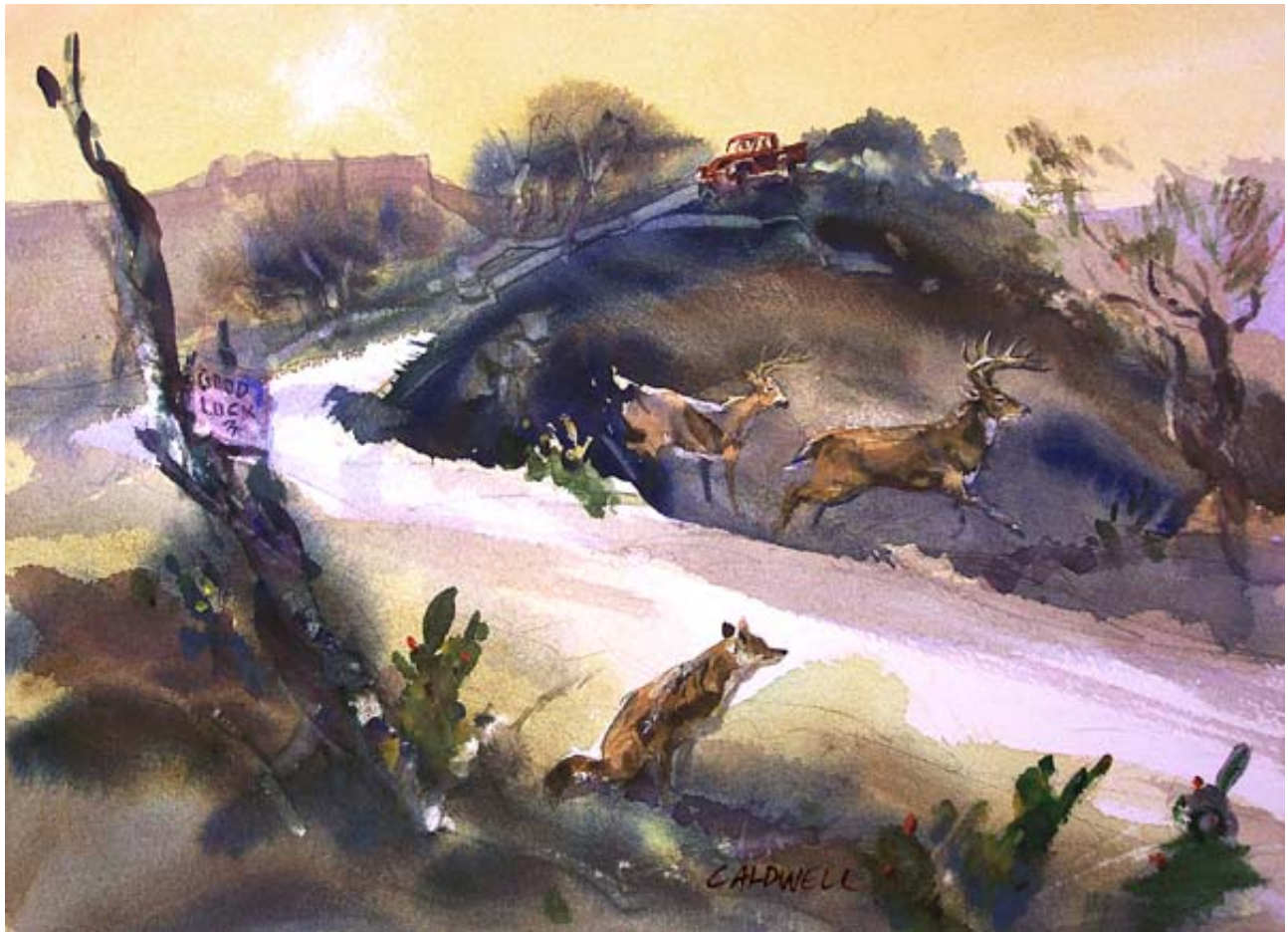
"One Helluva Buck" (Best Outdoor Illustration, 2008) "Ambush At Dawn"