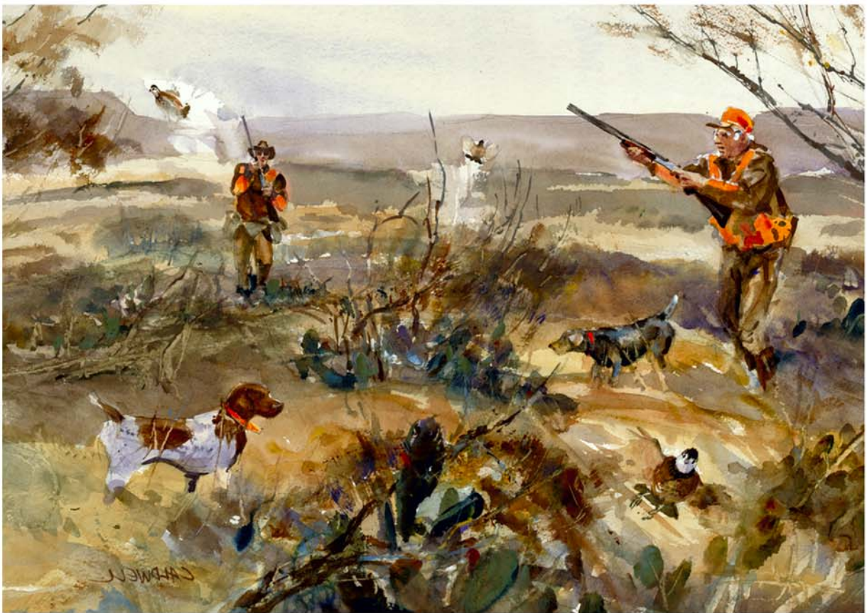
Six studies for "Quail Explosion"